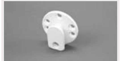
Metal end support end cap white for Rollux-Atos mechanism.