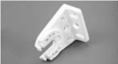
Universal support bracket for Rollux-Atos mechanism.