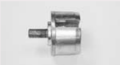
60mm Metal tube end round tip for Rollux-Atos mechanism.