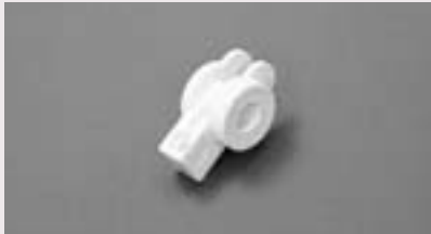
Plastic bearing with screw and nut for Rollux-Atos mechanism.