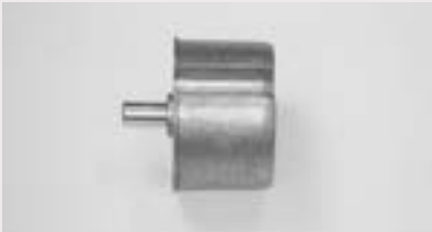
78mm Metal tube end round tip for Rollux-Atos mechanism.