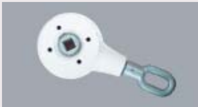
Manual system control 1:3 for Rollux-Atos mechanism.