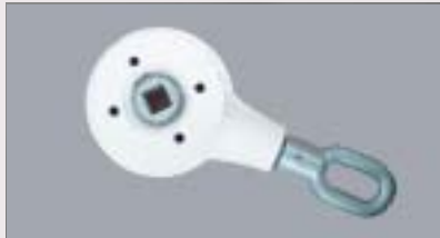
Manual system control 1:3 for Rollux-Atos Mechanism.