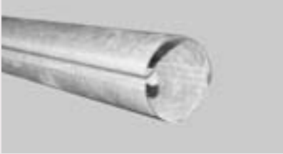
60mm Galvanized roller shades tube with groove for Rollux-Atos mechanism.