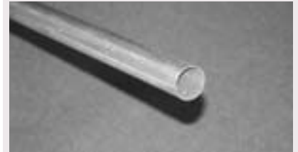
Galvanized metal bottom rail tube 40mm for Rollux-Atos mechanism.