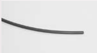
Plastic insert tube for Rollux-Atos mechanism.