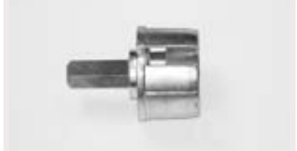
60mm Metal tube end squared tip for Rollux-Atos mechanism.