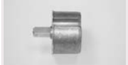
78mm Metal tube end squared tip for Rollux-Atos mechanism.